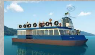
Catamaran Cruise Double Decker